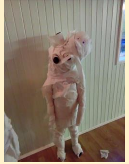
One way of keeping a Brownie quiet!