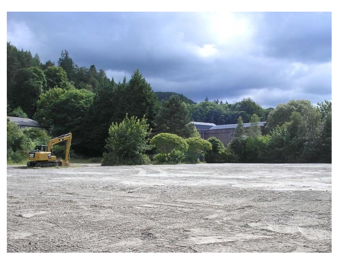
The Fish Farm has now been removed