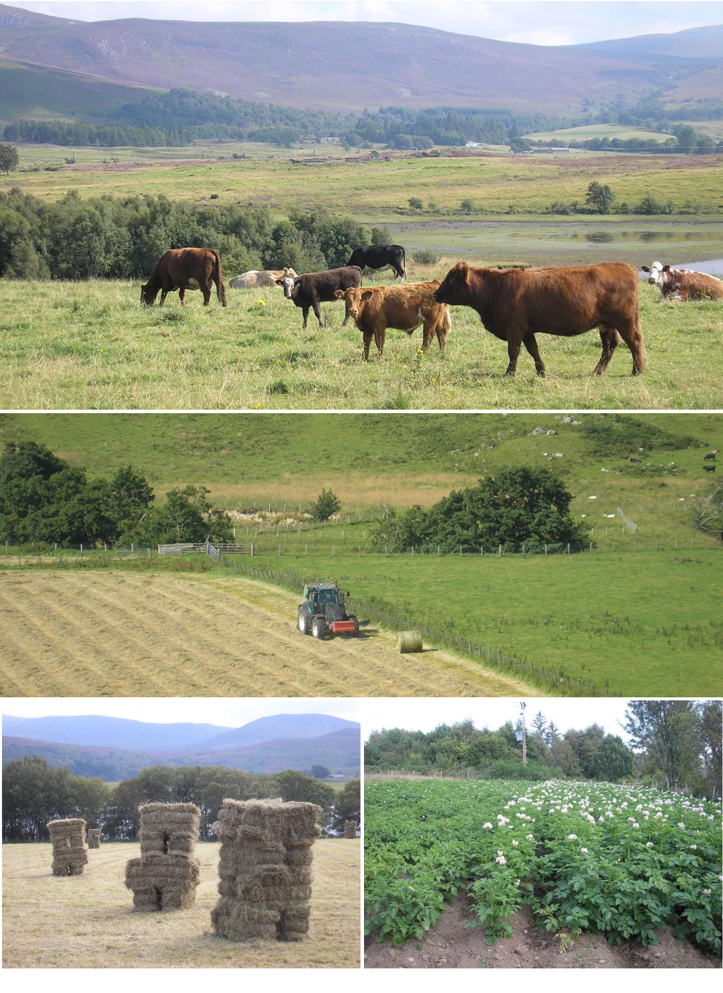
Cattle above Loch Garth, Haylage on Strath Farigaig at Leadclune, Haybales at the Lyne of Gorthleck and Potatoes on Lochgarthside