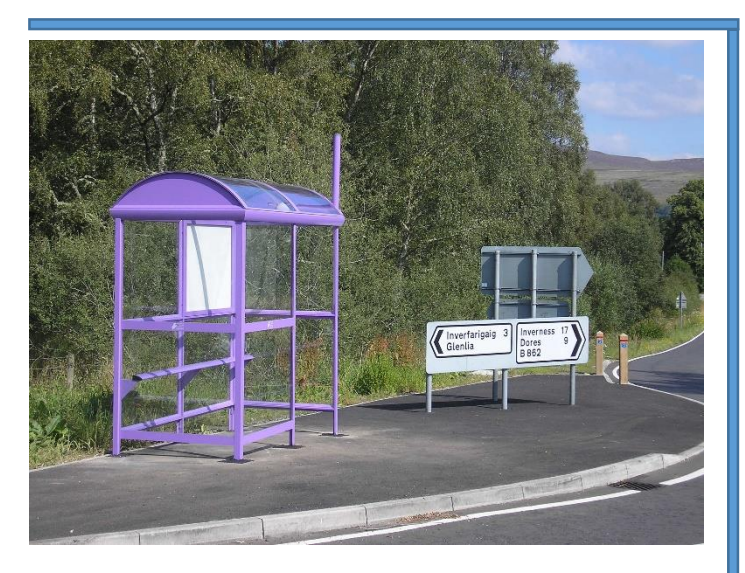
There is a new Bus Shelter at Errogie Corner

The Trust are currently working with SSE toward agreeing terms for the acquisition of the land and then hope to commence practical works, so watch this space for further news and developments.